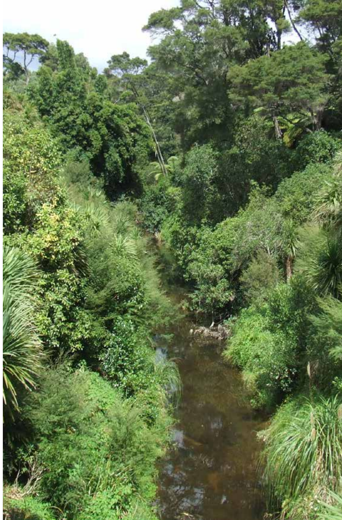
1. Vegetation surrounding Opanuku Stream is a mix of exotic and native species with a moderate level of natural character