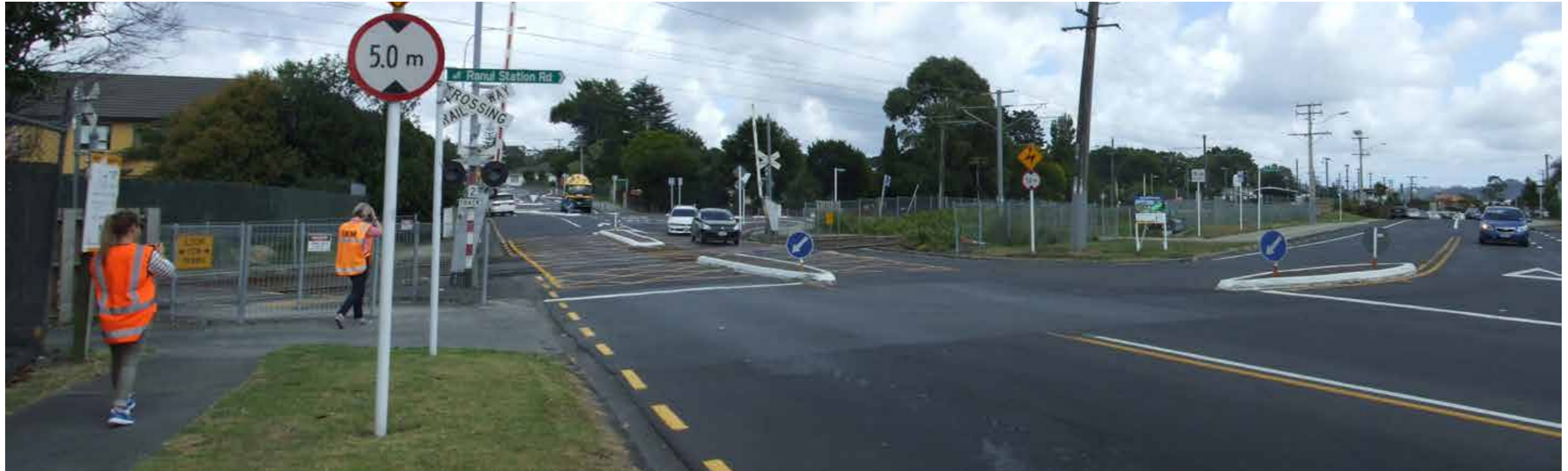
9. View of the Metcalfe Road rail crossing