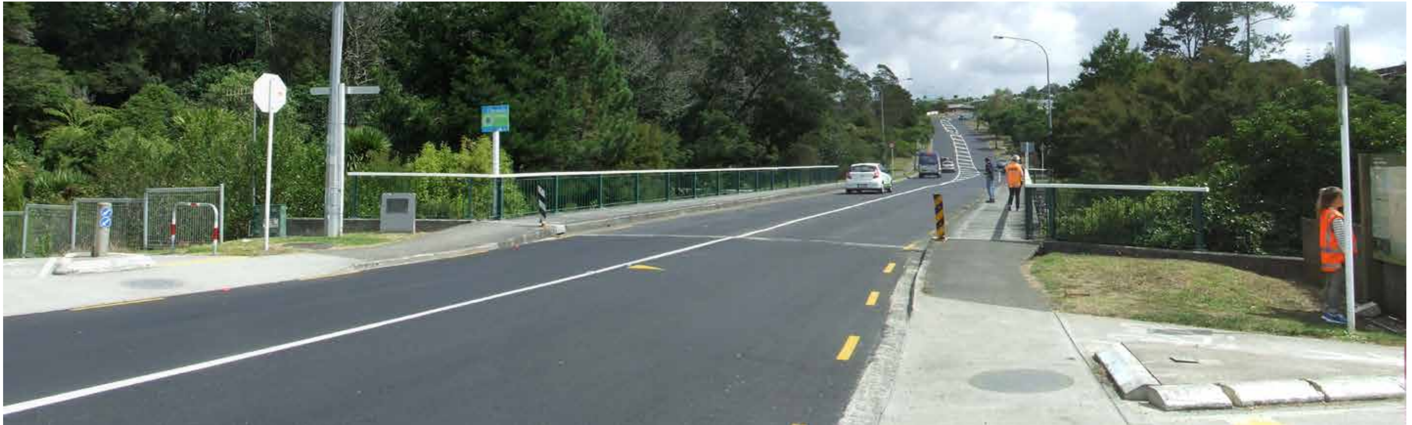
5. View of Opanuku Stream looking northwest