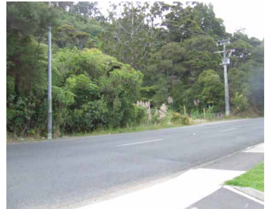
4. The bush at the Woodland reservoir is a predominantly native and well-established, providing a high level of amenity and natural character to the area.