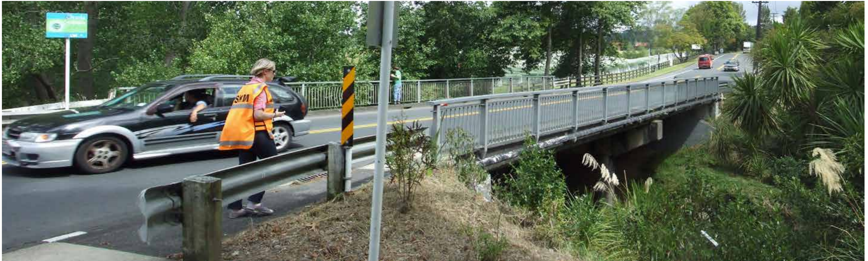
3. View along Parrs Road including Oratia Stream