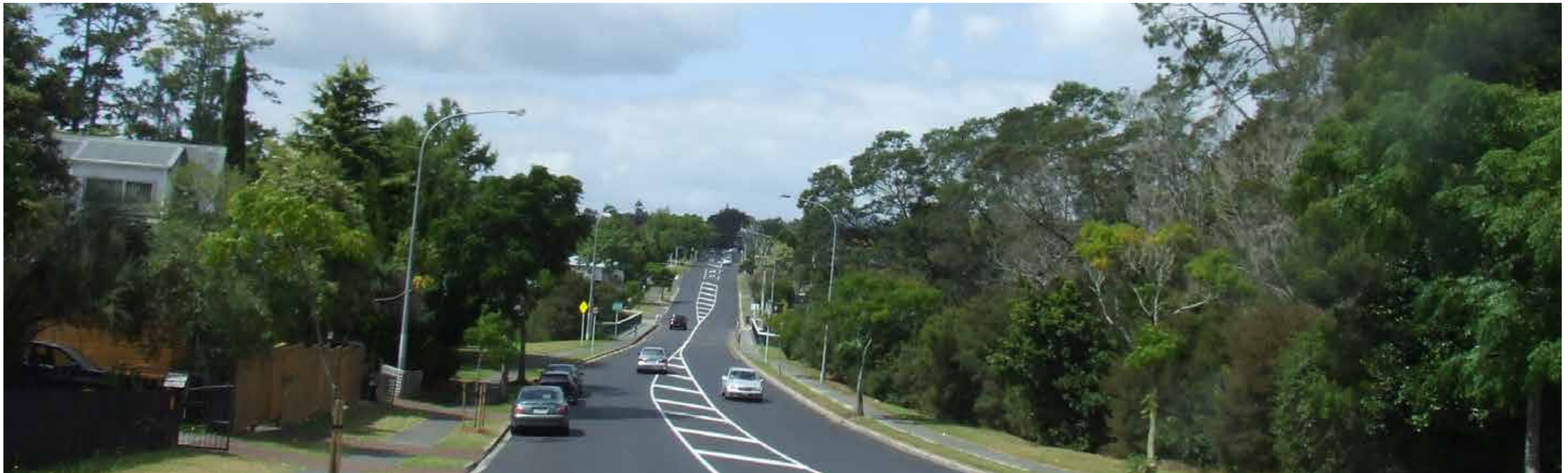
6. View along Palomino Drive including Opanuku Stream