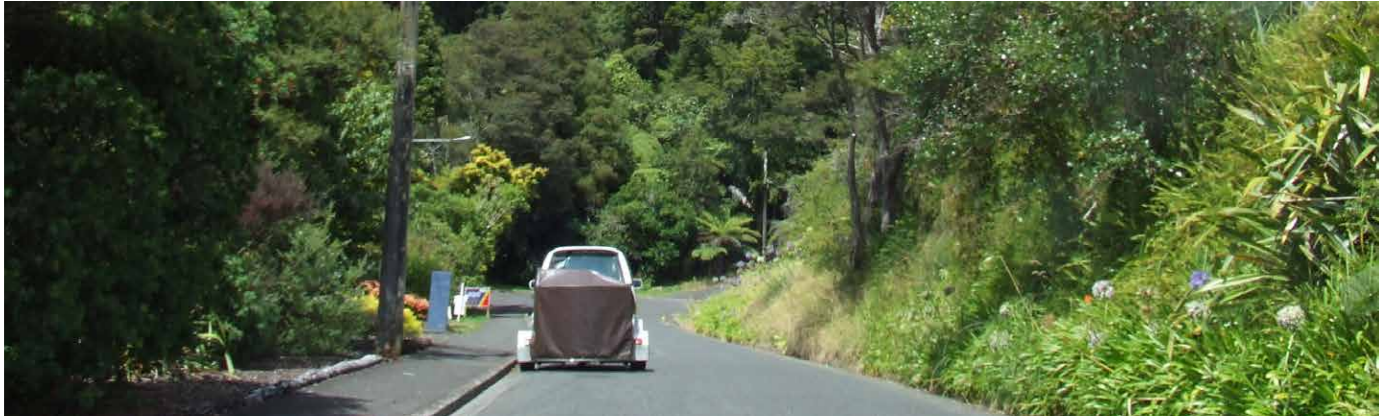
1. View along Shetland Street