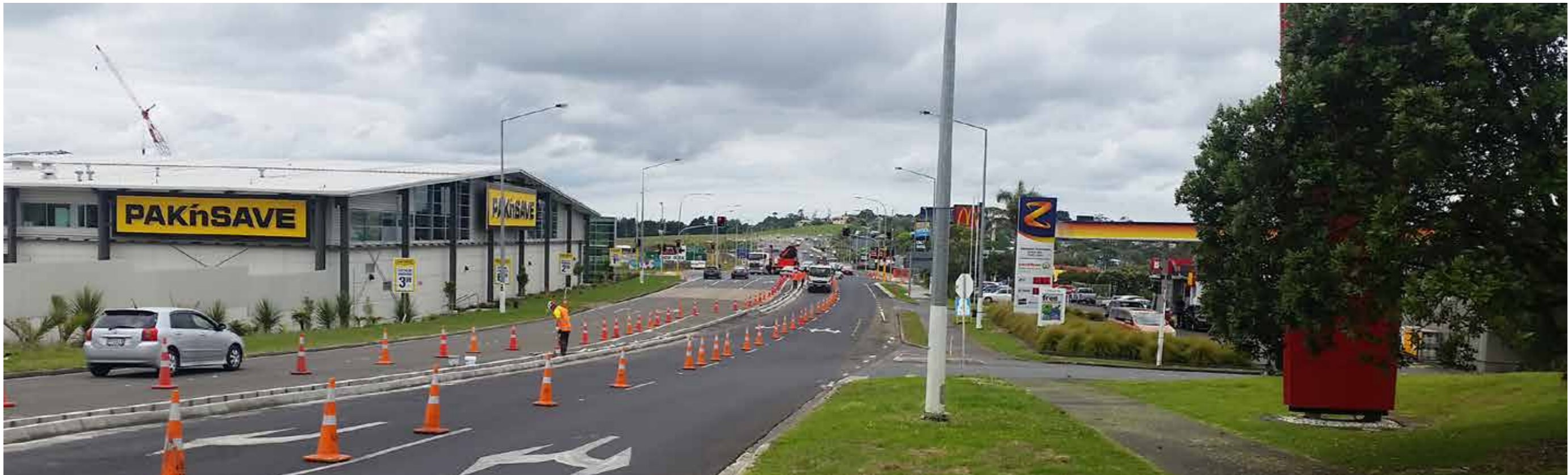
12. View along Fred Taylor Drive