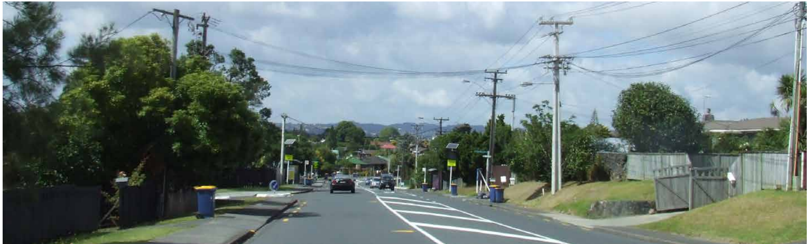
10. View along Don Buck Drive looking south at the intersection with Zita Maria Drive