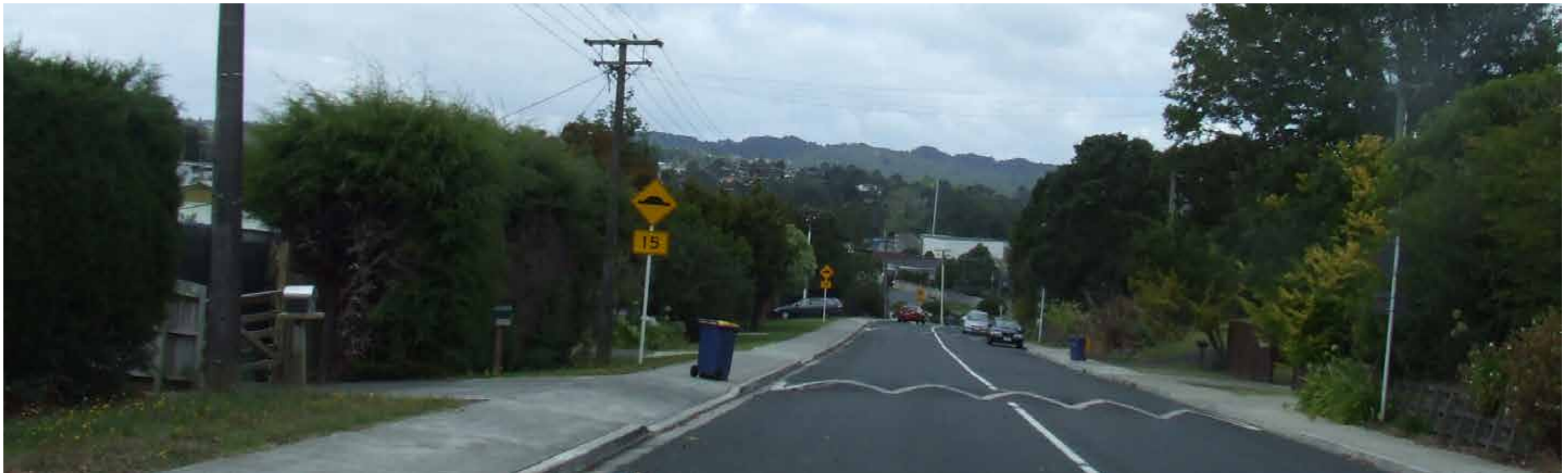
4. View looking south down Parrs Cross Road