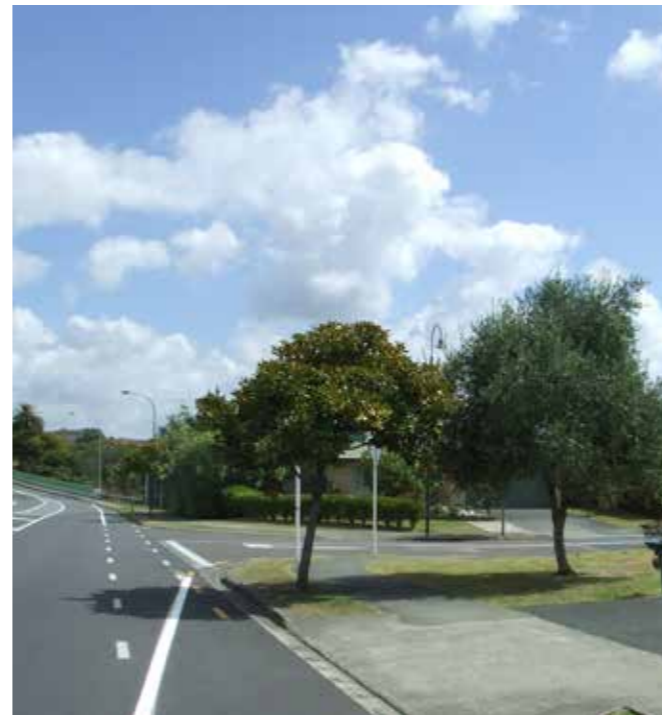
3. On Summerland Drive there are a number of small Magnolia trees which have been planted as street trees. However, they are not of scale yet to influence the character of the area