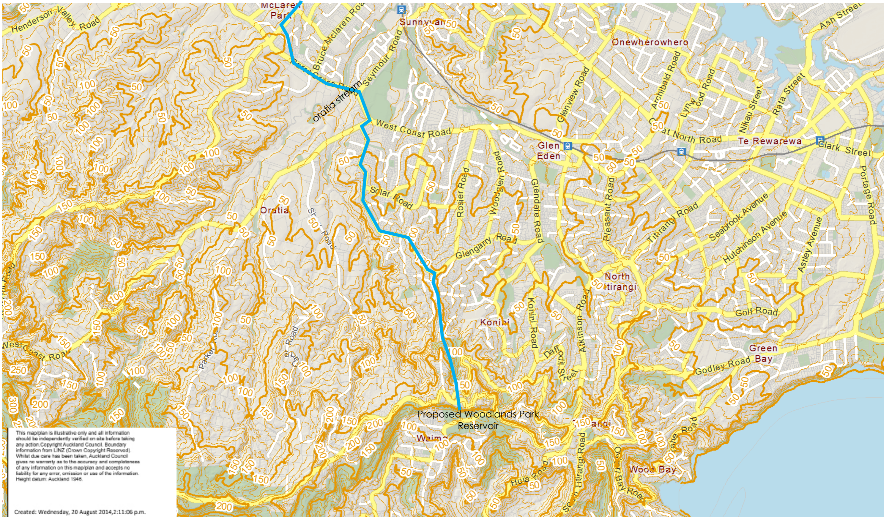
contour map (1:25000@A3 approximately - taken from Auckland Council GIS viewer)