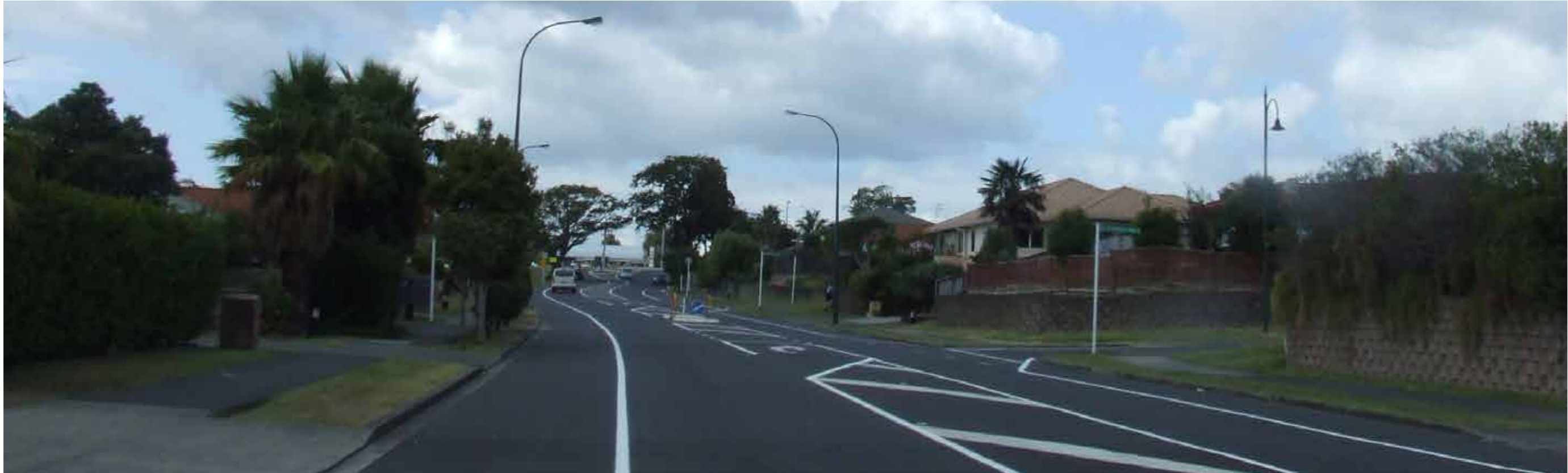
7. View south along Summerland Drive up to Palomino Supervalue