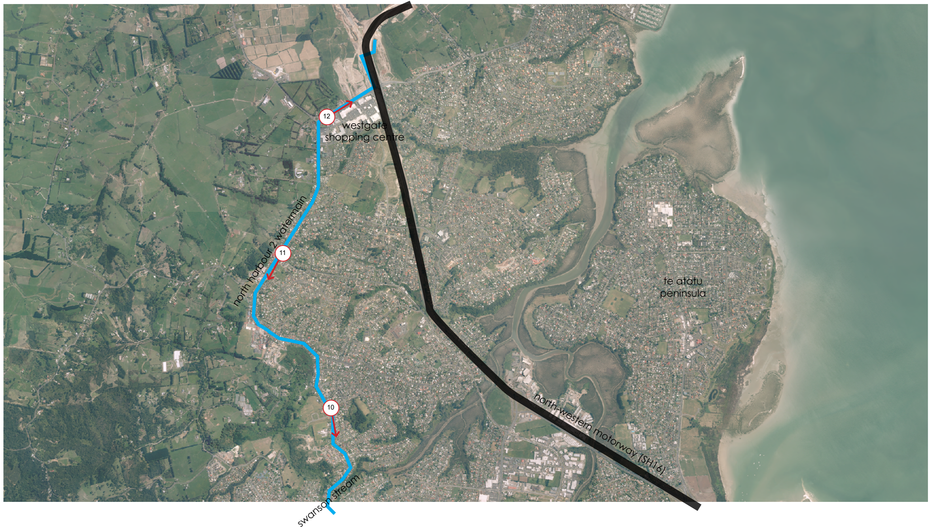
photo location map (1:25000@A3 approximately)