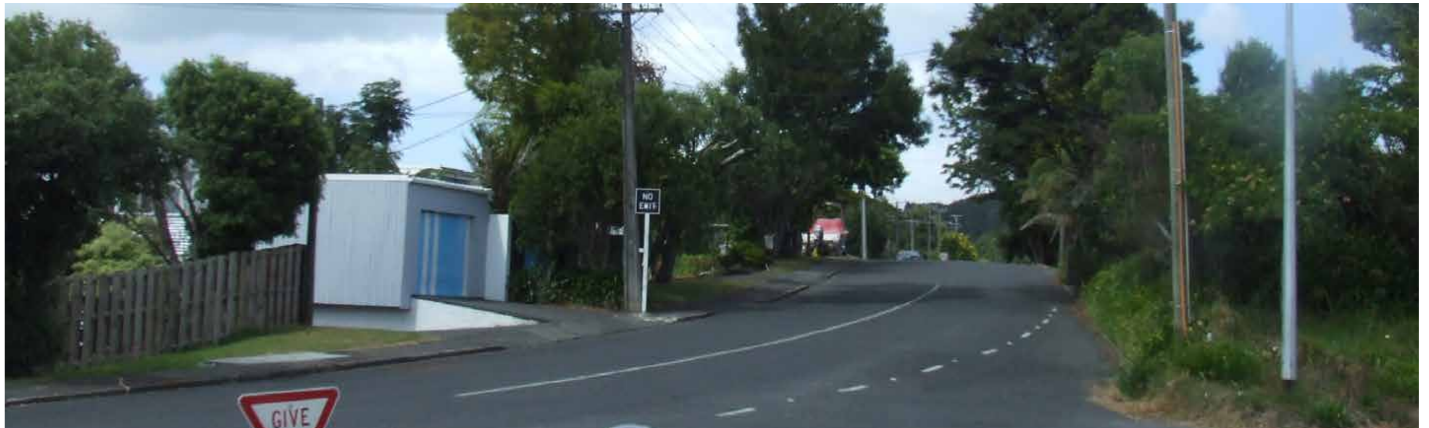
2. View from intersection of Phillip and Shetland Streets