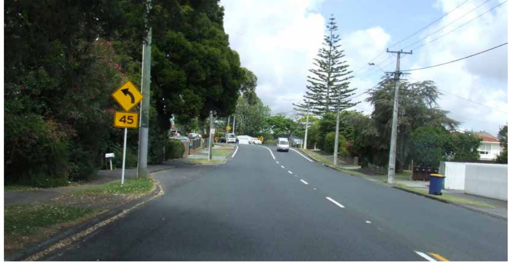
2. The width of the road corridor varies along the alignment along with the proximity of trees, but is generally open with sufficient space available.