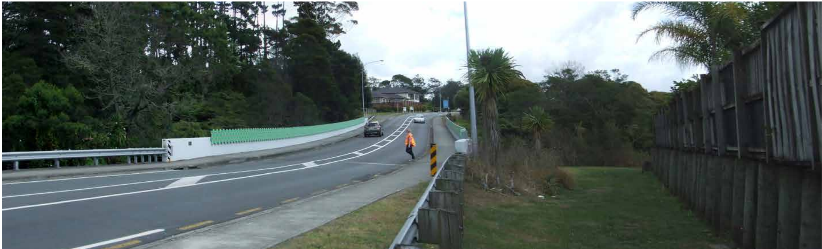
8. View along Summerland Drive including Paremuka Stream