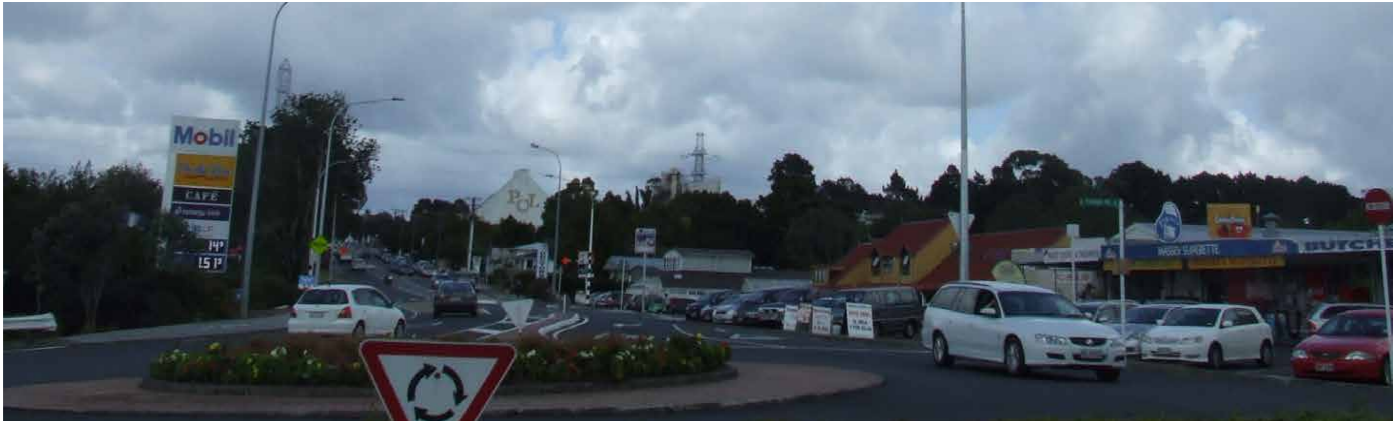
11. View along Don Buck Drive looking south at the intersection with Triangle Road